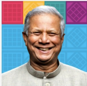
Prof. Muhammad Yunus Founder