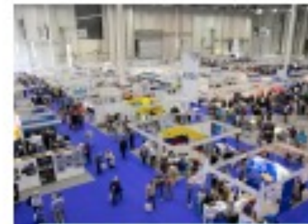
Virtual House of Friendship