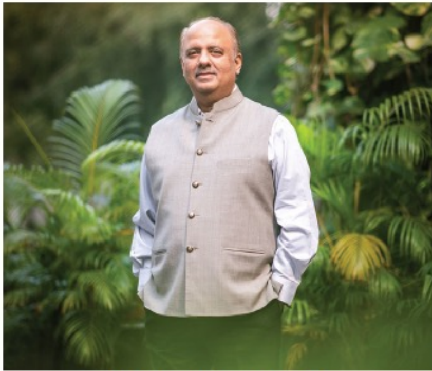
Rotary International President (2021-2022)