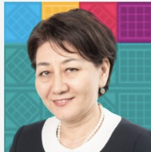
Dr. Oyun Sanjaasuren Director of External Affairs