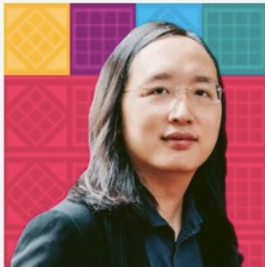
Hon. Audrey Tang Digital Minister of Taiwan Executive Yuan Republic of China (Taiwan)